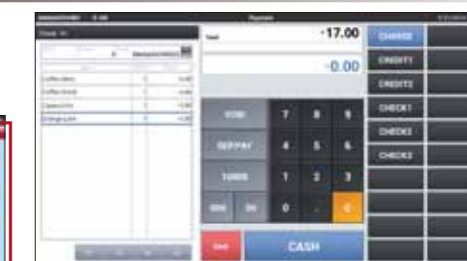
Support panel display examples