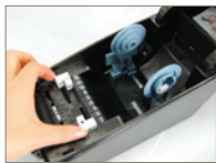
Transmissive sensor (Gap, Media sensor)