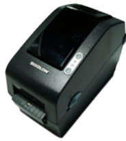
SLP-D220D (with Peeler)